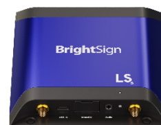
4K Basic I/O Package