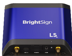
HD Basic I/O Package